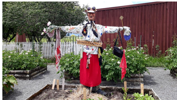
The Firth Tower Museum Community Garden