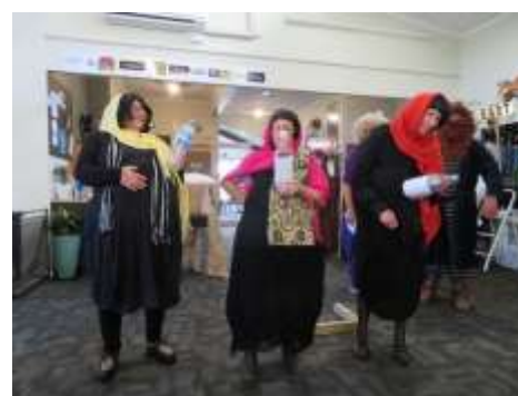
Clockwise from left: The star in the east: The bewildered shepherds: The now-wise women: The new king, complete with blue woolly bonnet.