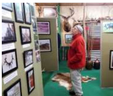
DEER STORY MUSEUM OUTING, MANAKAU, 17 JULY 2019.